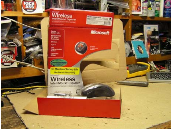
Figure 9 Time to break out some better mice; first the Intellimouse.

this a fair review, I decided to open up a few other optical mice I had in my vast supply of modding parts. I bought these other two optical mice on sale over the past year – both are wireless designs, where the Logitech M-BJ58 was a wired mouse. The two additions were the wireless Microsoft IntelliMouse Explorer 2.0 (figure 9) and the wireless Micro Innovations PD880P (figure 10) mice. Gaming mice these are not, but remember that I'm a trackball kind of guy.