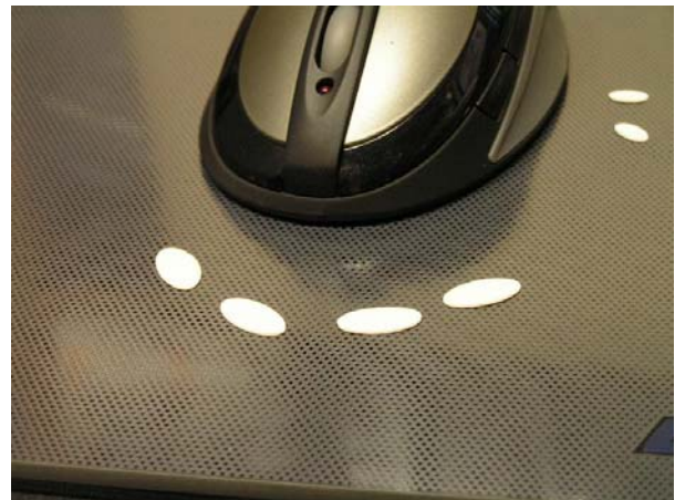
Figure 18 The untextured Teflon side of the SKATEZ PRO mice feet.