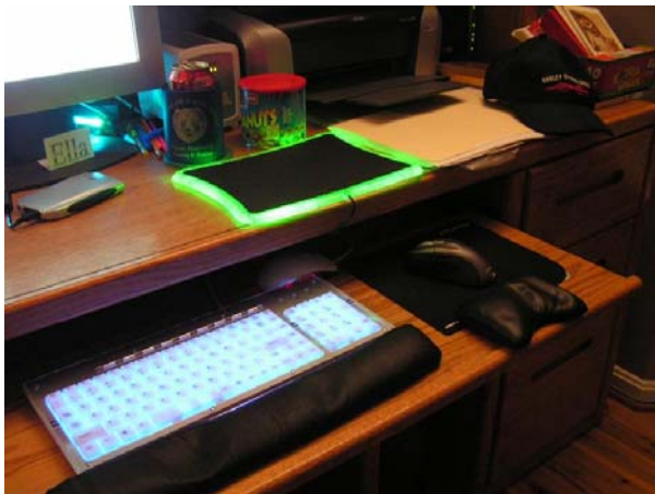
Figure 11 Out with the Thermaltake glow-pad, and in with the EYEpad.

I tried the smaller EYEpad mouse pad on my 'Ella' gaming computer first, since this configuration has a nice wooden desk with pull-out keyboard tray. I used both the Logitech and the Microsoft optical mice, and found that I couldn't detect any problems moving them across the cloth mousing surface. No tracking issues were noted when I watched the cursor move across the screen. I did tend to run out of mouse pad surface area though, as I was used to the size of that glowing Thermaltake plastic mousing pad you see in figure 11 (also shown there is the smaller EYEpad). So I swapped in the medium EYEpad mouse pad and just look how well it fits the keyboard tray (figure 12). Even when I put that wrist pad back in there (as shown in figure 11), I still have plenty of mousing room. Hey, I kind of like this medium EYEpad. It's a keeper!