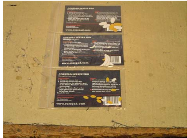
Figure 8 Different pads to cover the wide range of mice designs.

The Corepad SKATEZ PRO mice feet specifications from Corepad's web site: