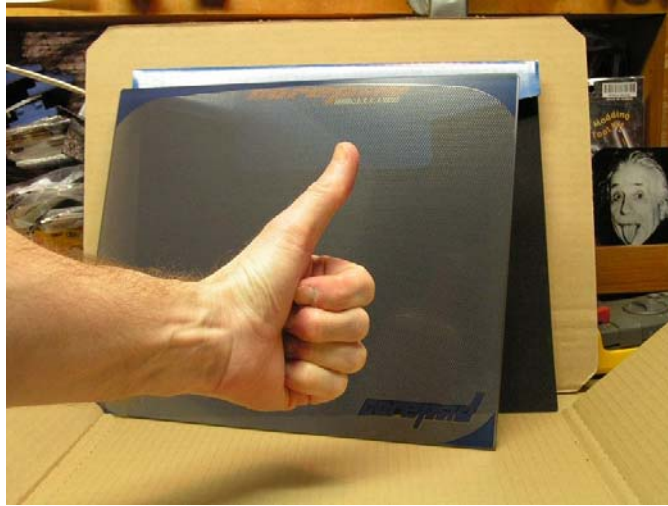
Figure 16 This glass pad gets a thumbs-up from Big Al!

in a year they will be showing signs of wear. Washable yes, but they will wear out over time? All the more reason to buy a few extra ones.