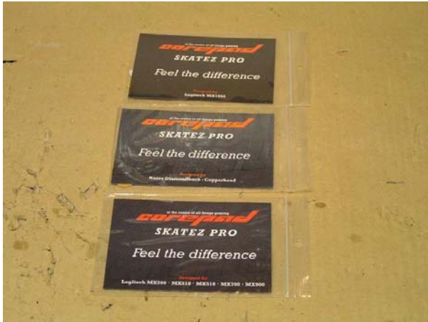
Figure 7 Three packages of SKATEZ PRO mice feet.

Lastly, we have the SKATEZ PRO mice feet. Three packages were sent, each one containing two sets of mice feet for either a specific mouse, or a range of mice models. The three sets we have are for the Logitech MX1000, the Razer Diamondback-Copperhead, and the Logitech models MX500, 510, 518, 700, and 900. Figure 7 shows you the packaging for these items, and in figure 8 you can see how the Teflon pads differ in shape.