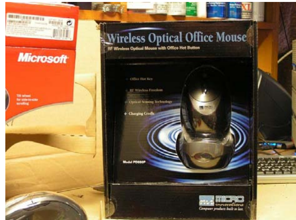
Figure 10 Here's the Micro Innovations bargain-bin special.

I tried the smaller EYEpad mouse pad on my 'Ella' gaming computer first, since this configuration has a nice wooden desk with pull-out keyboard tray. I used both the Logitech and the Microsoft optical mice, and found that I couldn't detect any problems moving them across the cloth mousing surface. No tracking issues were noted when I watched the cursor move across the screen. I did tend to run out of mouse pad surface area though, as I was used to the size of that glowing Thermaltake plastic mousing pad you see in figure 11 (also shown there is the smaller EYEpad). So I swapped in the medium EYEpad mouse pad and just look how well it fits the keyboard tray (figure 12). Even when I put that wrist pad back in there (as shown in figure 11), I still have plenty of mousing room. Hey, I kind of like this medium EYEpad. It's a keeper!