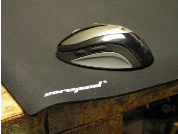
Figure 13 The Corepad DESKPAD XXXL up close.

Ok, we can't forget about the bigger EYEpad XL and the DESKPAD XXXL (figure 13), can we? These require much more room than a keyboard tray, so I set the larger mouse pads up on my workbench (figure 14). Here I used the Micro Innovations wireless optical mouse for some 'glide' and 'tracking' tests. These pads felt about the same as the smaller EYE pads (ignore the bumps you see, as they will flatten out in a few days), so I have to say that you should just get the size that fits your desk layout. Any one of these pads would be a good choice, and price-wise, they range from about $11.99 to $23.99 on-line. You can find most of the Corepad items at www.performance-pcs.com .