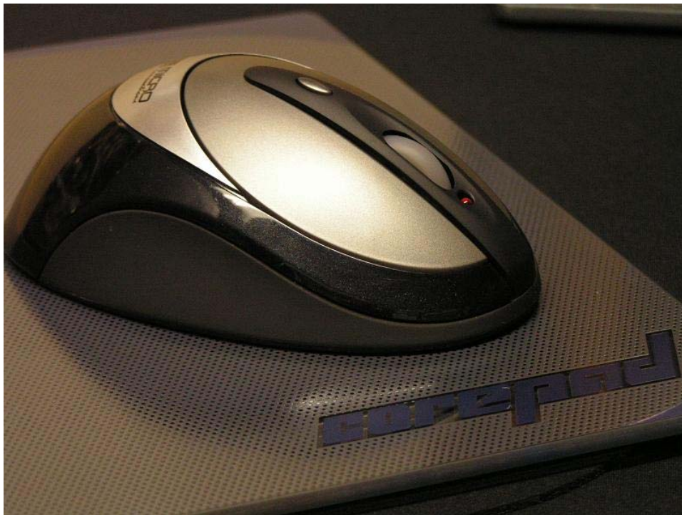
Figure 1 The Corepad MAGNA Gaming Pad has a very slick glass surface

If you love to game, then you probably use a mouse. Some people use the old-style ball mice, while others go for an optical mouse (conventional / trackball) or even a laser mouse. I mostly use trackball mice so I don't need to move my hand around too much, but I have a few optical mice too. I need to have a good selection of mice at my house for those tasty LAN parties I host periodically. Anyway, Hank over at Performance-PCs ( www.performance-pcs.com ) was able to send us a good selection of Corepad mousing products to review. Today we're going to evaluate the EYEPAD S, the EYEPAD M, the EYEPAD XL, the DESKPAD XXXL, the MAGNA Safety Glass Gaming Pad (figure 1), and three sets of SKATEZ PRO mouse feet.