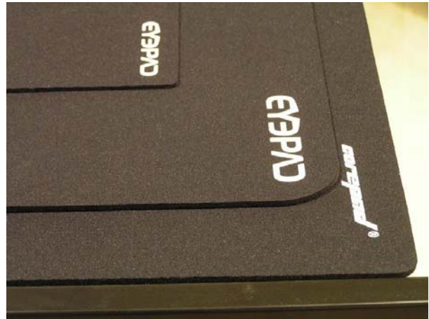
Figure 3 The DESKPAD is 0.12 inches thick, the others are 0.06 inches.

Corepad EYEpad and DESKPAD series cloth mouse pad specifications from Corepad's web site: