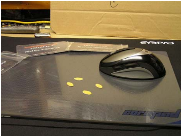
Figure 17 The backing tape side of the SKATEZ PRO mice feet.

That leaves us with some mice feet testing. Performance PCs sent us three sets of the SKATEZ PRO mice feet, but none of these sets were a direct fit for the three types of mice I had on hand. If I tore off my current mice feet and replaced them with SKATEZ PRO mice feet, it wouldn't be a good solution for me. So I did the next best thing. I pulled out samples from the three sets, and placed them under my mice to get a feel for the different sliding motion. These mice feet are better than what comes stock on your mouse. Of course, I'm talking about non-gaming mice here. I don't know what type of mice feet are installed on the high-end gaming mice like the Razer Diamondback series and Logitech MX series. I also moved the mice feet pads around individually with my most precision instrument available (yep – my finger), and I did this on several surfaces, not just the cloth and glass mouse pads. They are slick. I pulled the backing tape (figure 17) off a few of them, and found that they do stick. What's more, they slide so well because they use untextured Teflon (figure 18) and that makes the SKATEZ PRO series a top pick.