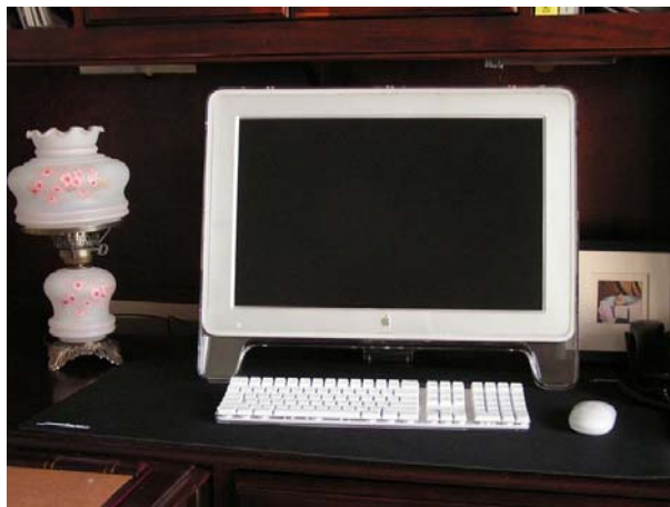
Figure 15 The large desk area is a perfect fit for the DESKPAD XXXL

I was able to find an excellent place to test the DESKPAD XXXL in a real application. We have a friend that owns one of those Power MAC G5 machines – you know two IBM G5 microprocessors in that beautiful aluminum case. Anyway, she has the large Apple cinema display to support her photography work. The large work area afforded by the DESKPAD XXXL is perfect on the desktop, as shown in figure 15.