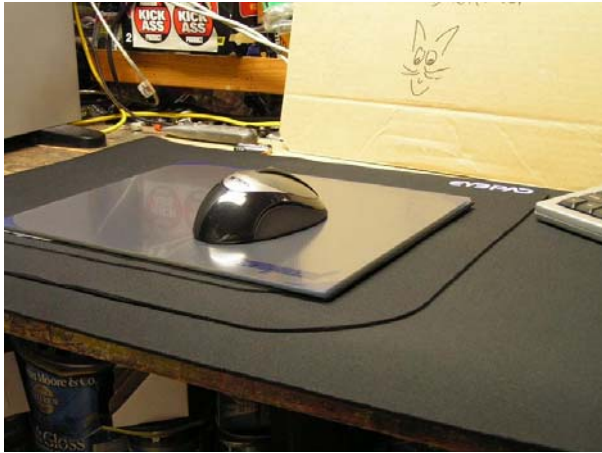
Figure 19 Glass or cloth? I can't decide this for you.

Personally, I liked the Corepad cloth mouse pads the best (figure 19). I thought those would be a distant second place to the MAGNA safety glass mouse pad, but there is something about the smoothness of the cloth pads that I like. Neither mouse pad is really better or worse than the other one. It comes down to personal preference. As they said in the movies, "Go with your feelings Luke. Feel the force." Or in this case, feel which one takes less force to move the mouse. The SKATEZ PRO mice feet (figure 20) were fine, and I think these would be a great replacement for your current mice feet if they are worn thin. The sticky side appears to hold well, but if you are real aggressive with a mouse, I don't know if they can be torn off with hard use. I guess any mice feet you place on your mouse would be subject to the same question. I doubt you can do better than untextured Teflon however.