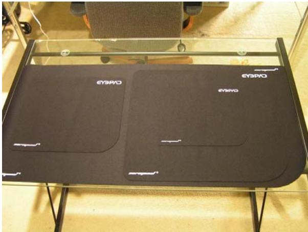
Figure 2 The cloth Corepad mouse pads laid out for comparison.

The cloth mouse pads from Corepad come in several sizes, and we have a good selection (but not all of them) for this review. In figures 2 and 3, I have laid out the pads on a glass table for size comparison. All the smaller cloth pads are 0.06 inches thick, while the DESKPAD XXXL is 0.12 inches thick – basically twice as thick as the smaller pads. You don't really notice the difference in thickness when using the pads, but I think the reason for the greater thickness in the DESKPAD XXXL has to do with long term durability.