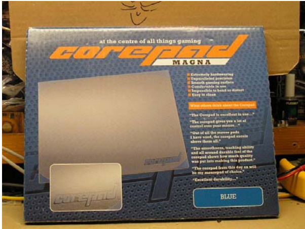
Figure 4 Packaging for the MAGNA gaming pad.