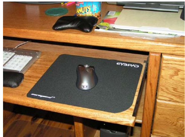
Figure 12 The medium EYEpad is a perfect fit for me.

I was paying close attention to the difference between that old Thermaltake plastic mouse pad and the new Corepad cloth mouse pads. There was a definite improvement in both 'feel' and 'tracking', but it's a hard thing to measure. Perhaps over time both will wear differently and I'll reverse my option. If I was looking for a non-emotional measurement, I guess I could try to measure the coefficient of friction values between the mice and the mouse pads, but not easy to do without precision equipment. I did notice that cat hairs were attracted to the cloth mouse pads. We have four cats, so I need to keep the kitties away from my keyboard area.