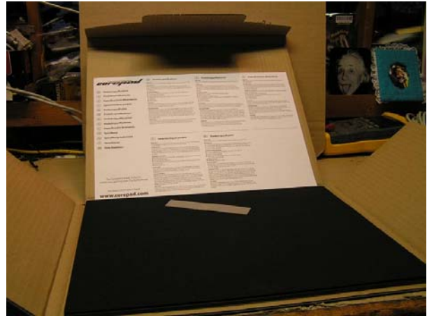
Figure 5 Open up the box, and see how well protected the glass is.