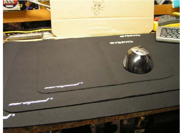
Figure 14 Size comparison between the larger cloth mouse pads.

I was able to find an excellent place to test the DESKPAD XXXL in a real application. We have a friend that owns one of those Power MAC G5 machines – you know two IBM G5 microprocessors in that beautiful aluminum case. Anyway, she has the large Apple cinema display to support her photography work. The large work area afforded by the DESKPAD XXXL is perfect on the desktop, as shown in figure 15.