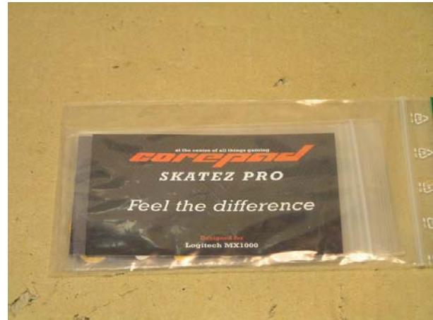
Figure 20 Hard to test unless you put your finger on it.